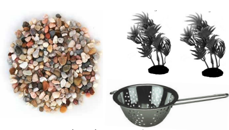
Gravel and Decorations are not included with this aquarium kit.